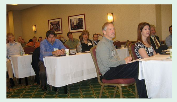
Members of the Clinic Directors & Administrators SIG heard speakers on a wide variety of topics during the annual meeting in Chicago.