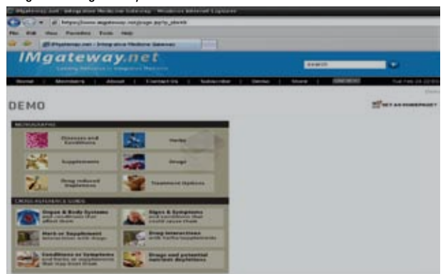
Figure 4. IMgateway website